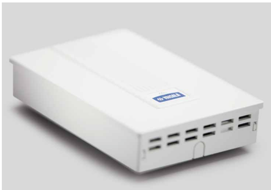
The Vaisala CARBOCAP® Carbon Dioxide Transmitter GMW115 is a wall-mounted CO 2 transmitter for demand controlled ventilation.

The wall-mounted Vaisala CARBOCAP® Carbon Dioxide Transmitter GMW115 is a compact transmitter for measuring room carbon dioxide levels in building automation applications.