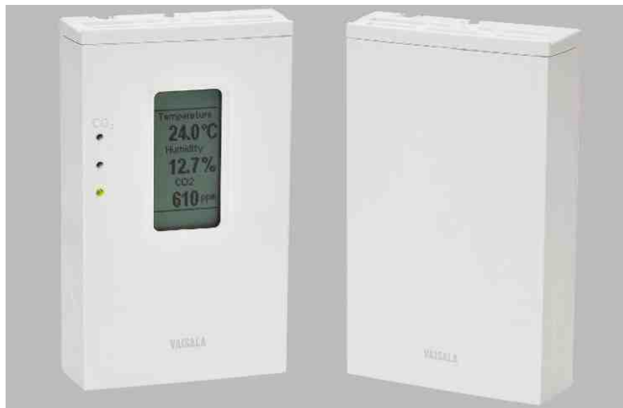
GMW90 Series Carbon Dioxide, Temperature and Humidity Transmitters for HVAC are available with either a display opening or a solid front. An optional traffic light indication can also be selected.

The Vaisala GMW90 Series CARBOCAP® Carbon Dioxide, Temperature, and Humidity Transmitters are based on new measurement technology for improved reliability and stability. With the new technology the transmitter's inspection interval is extended to five years.