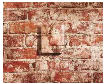
Make the transmitter blend into your interior design with the optional decorative cover.

exchangeable measurement modules. Sensor traceability and measurement quality is easily maintained by snapping on a new module calibrated at Vaisala factory. The instrument can also be calibrated using a hand-held meter or reference gas CO 2 bottle. The service interfaces are easy to reach by simply sliding the cover down. The closed cover keeps the measurement environment stable during calibration and ensures a top-quality final result.