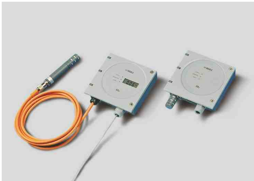
The GMT220 transmitters withstand harsh and humid environments.