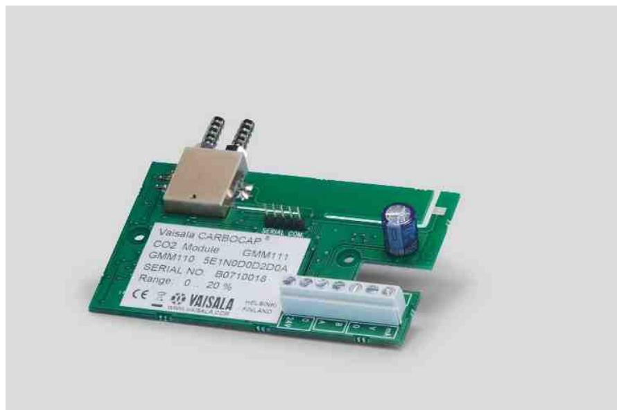
The Vaisala CARBOCAP® Carbon Dioxide Module GMM111 is a CO 2 measurement module with flow-through aspiration.